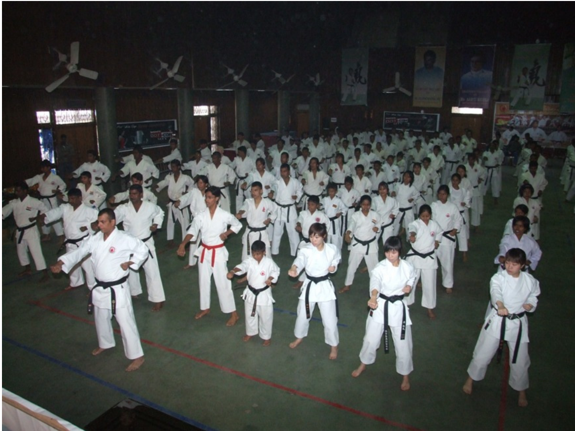
Seiko-Kai Seminar India