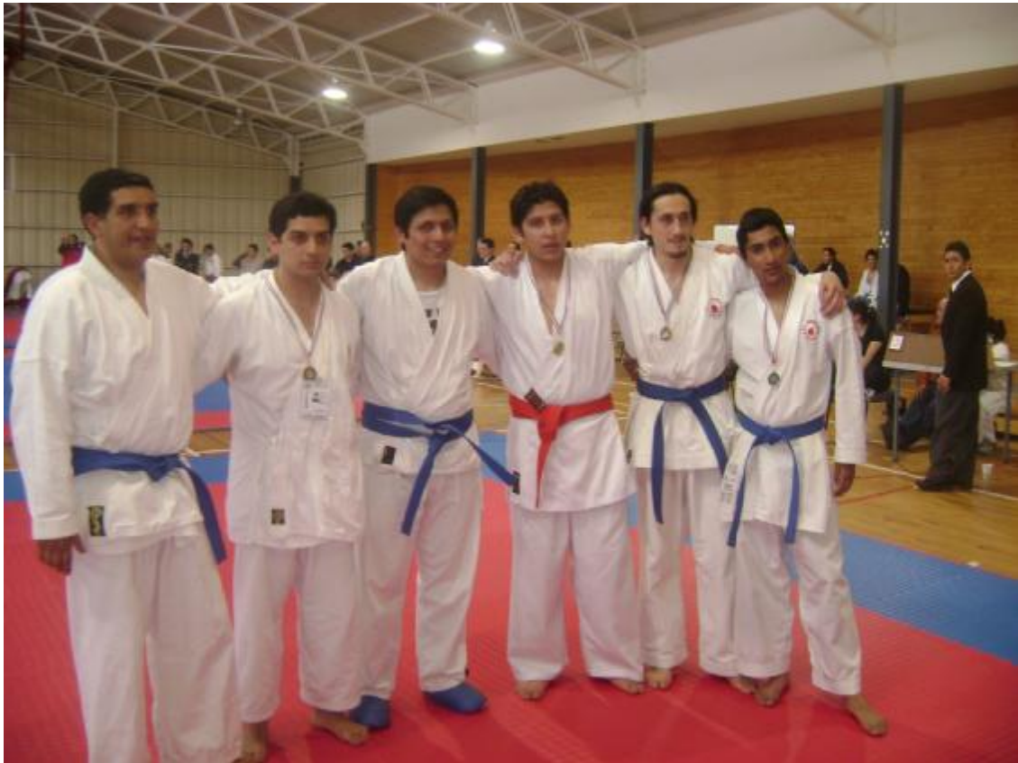
Members of Seiko-Kai Chile celebrate their success